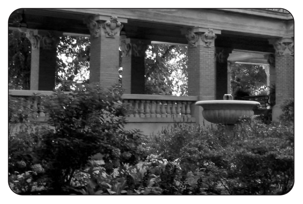
Mark your calendars for the Children's Summer Garden Party on Saturday, June 10 from 1 pm to 4 pm. This family-friendly program features storytelling, art, and magic—all with a multicultural theme. Free admission to grounds. Refreshments available.

As you make your choices for spring planting, do visit us and see what we have to offer in the way of ideas for your garden. We're here every Wednesday from 10 to 3 and on Thursday from 1 to 3.