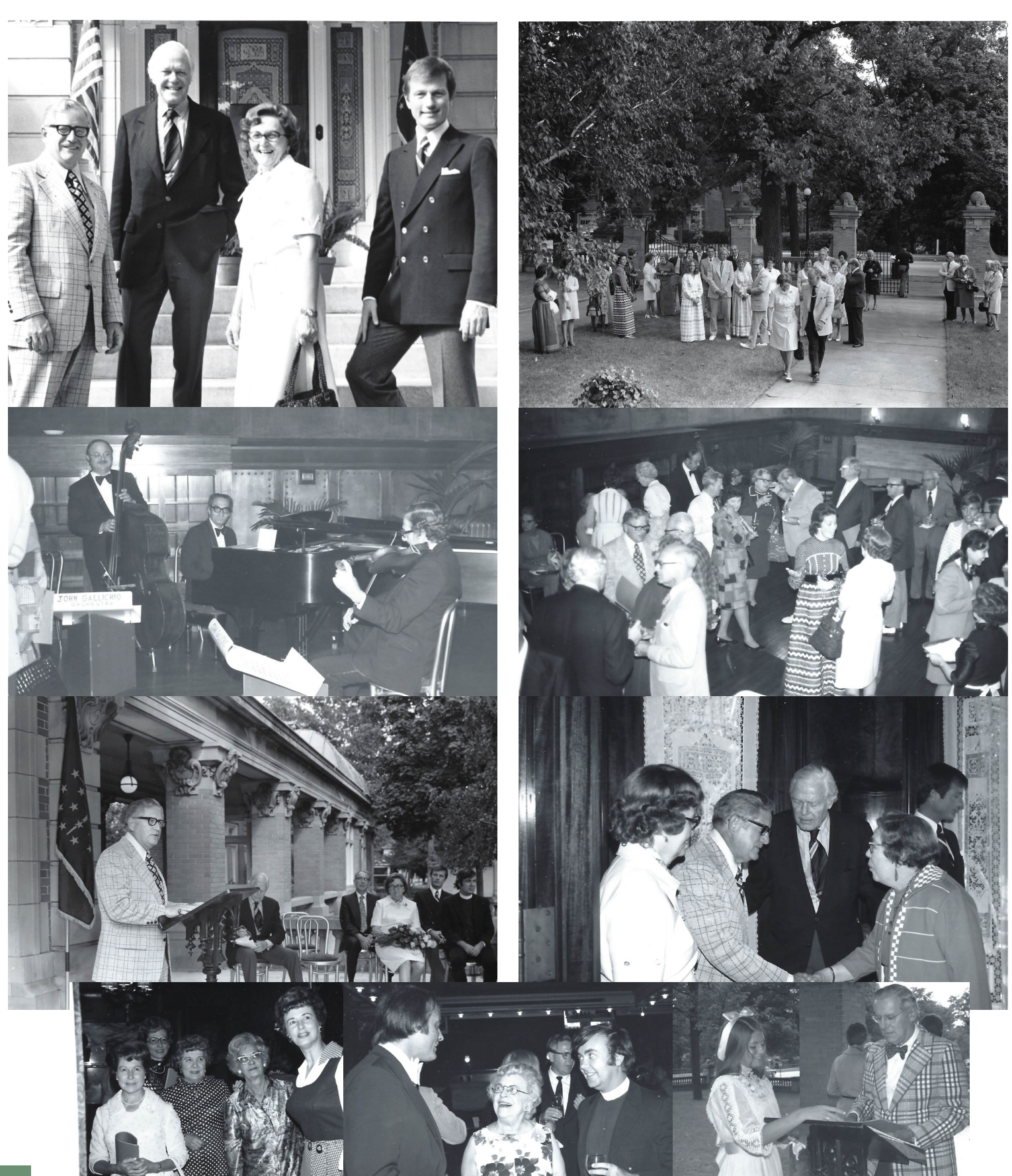
Opening Day, September 8, 1973